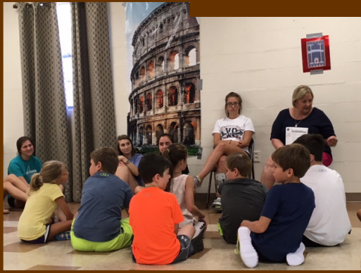
Vacation Bible School